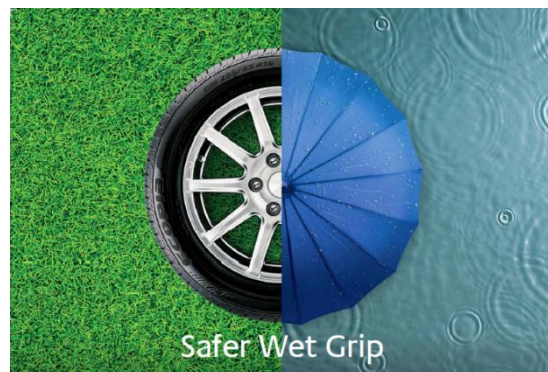
Safer Wet Grip

In addition, the new tread pattern contributes to anti-hydroplaning performance, better handling and reduced noise.