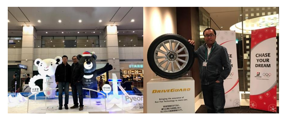
As the only dealer of Bridgestone Vietnam sent to Pyeongchang 2018, B-select Thai Phung is a good example of the passenger car service center model

Bridgestone Vietnam invited our notable dealer B-select Thai Phung (Tay Ninh) to participate at the Olympic Winter Games PyeongChang 2018 as honored guests.