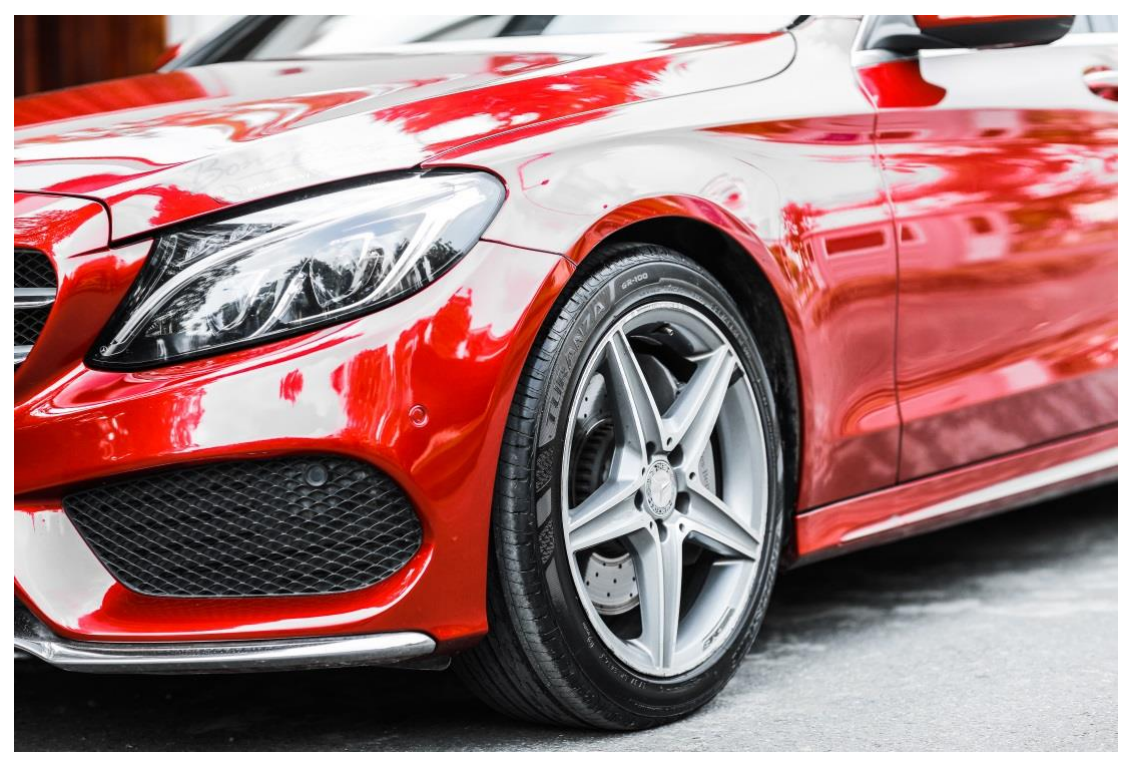
Turanza GR100 is designed to absorb noise and prevent disturbance from entering the cabin, creating a quiet and comfortable space for all passengers.

The sound-proof ability and smoothness of Turanza GR100 has been proved by Vietnamese customers after 01 month of usage through the program "Experience the smoothness with Bridgestone Turanza GR100" implemented before. Installed in mid-and-high-end vehicles, Turanza GR100 has been perceived very positively from the end users.