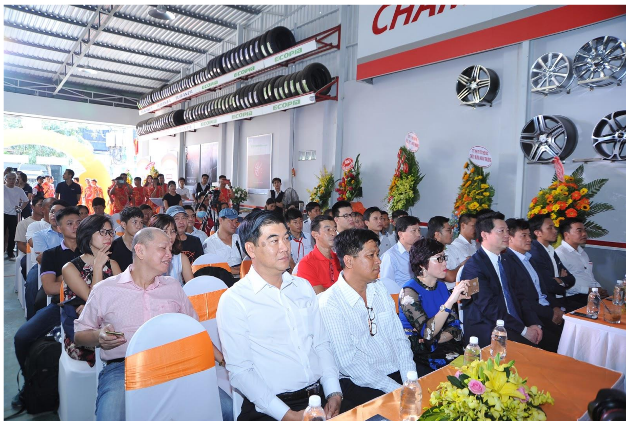
Car owners and representatives from Bridgestone, Motul and journalists attended in the event.

Last 26 th October, over 100 cars and customers attended in the “Bridgestone Tire Safety” event was held by Bridgestone. This activity was co-held with the opening ceremony of the Premium Passenger Tire Care Service Center - B-select Van Loi at 1496 Huynh Tan Phat, D7 (near the intersection of Pham Huu Lau).