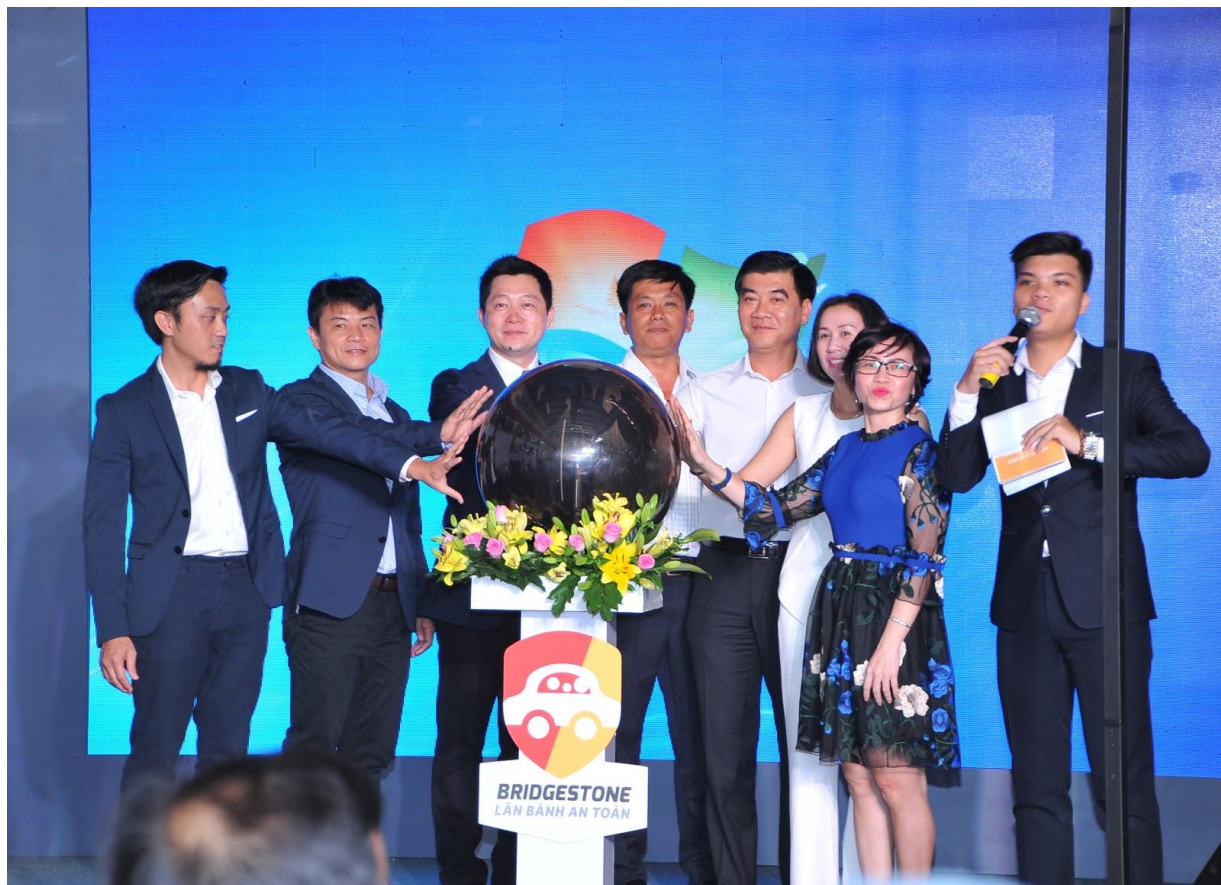
Bridgestone, B-select Van Loi and other representatives in the day of collaboration

B-select is the name of Bridgestone the Premium Passenger Tire Care Service Center. This is a model Bridgestone has researched and developed for many years in order to bring the international car care services for local customers when they choose Bridgestone car care services and tires.