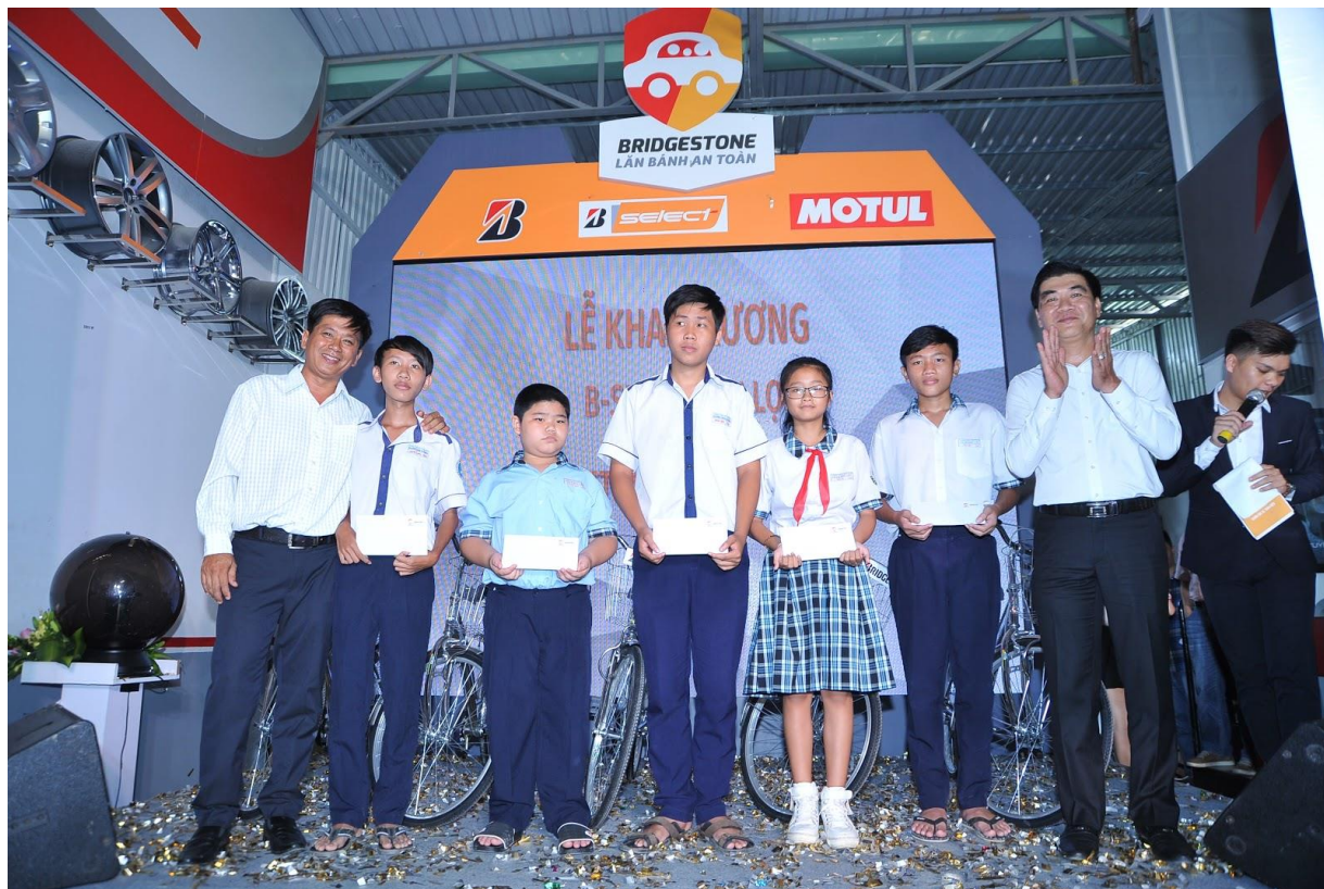
B-select Van Loi representative and authority giving scholarships to student.

and many other discounts, etc. as well as the car care consulting from experienced technicians. All of the tickets that were sold in event (300.000 VND/ ticket) used to fund for local charities.