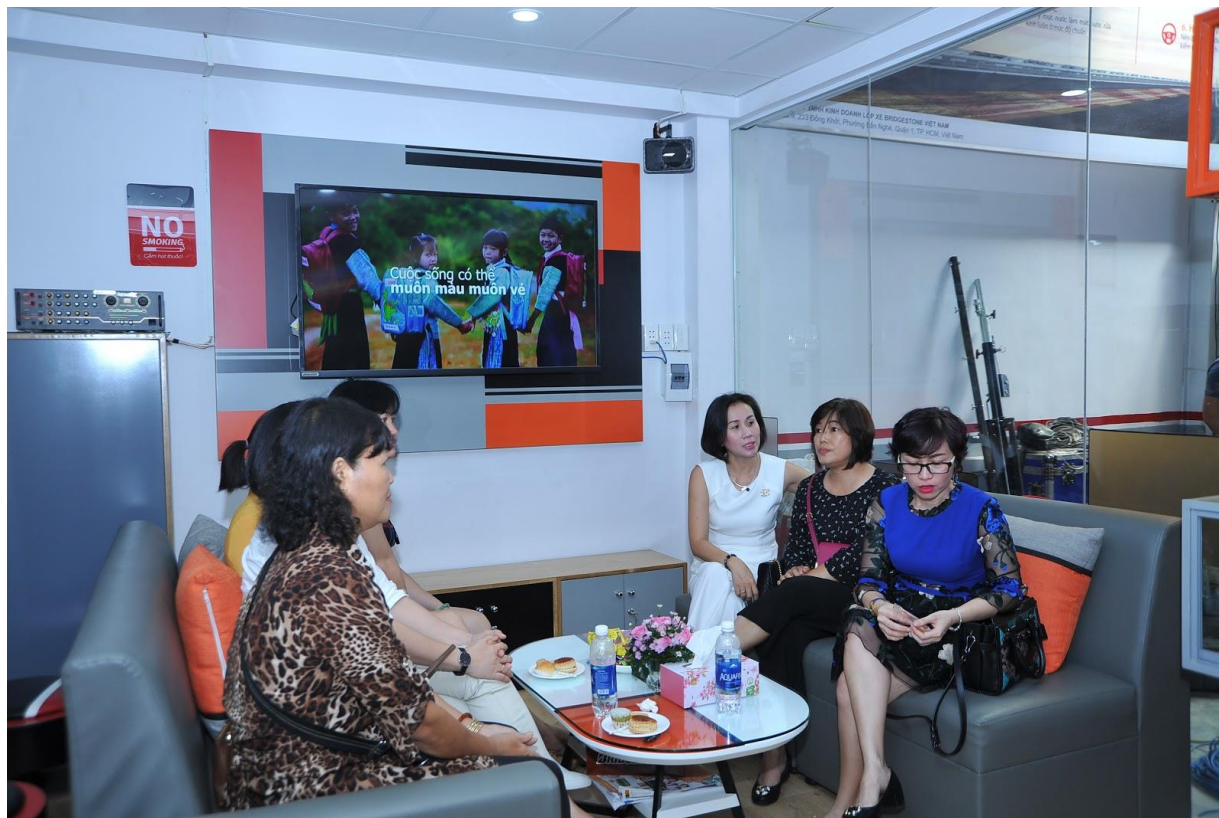
Lounge filled with daily newspapers, magazines and TV.

With 55 years of development, Van Loi now is not only a local business but one of the leading factors in enhancing the landscape of Vietnam tire market. Besides the business, Van Loi carries the responsibility for the community and especially, the safety for anyone behind the wheel.