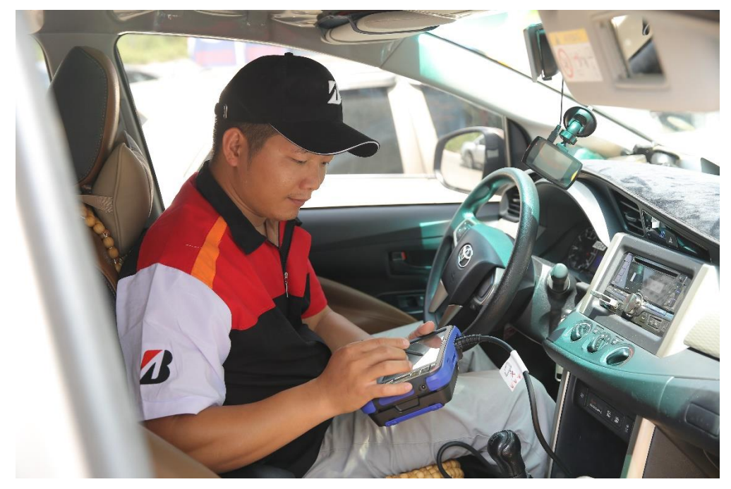
Joining the event, customers will have their tyres checked by experienced technicians with modern machines

particular, along with each newly opened B-select store, Bridgestone Vietnam always brings the ambition of bringing and spreading safety to everyone through the series of "Tyre Safety". This event is not only bringing essential deals for car enthusiasts, but also giving an opportunity for them to enhancing knowledge about safety as well as providing comprehensive equipment and caring services from inside out, ensuring all things on the road will always be smooth, and all ways home are safe.