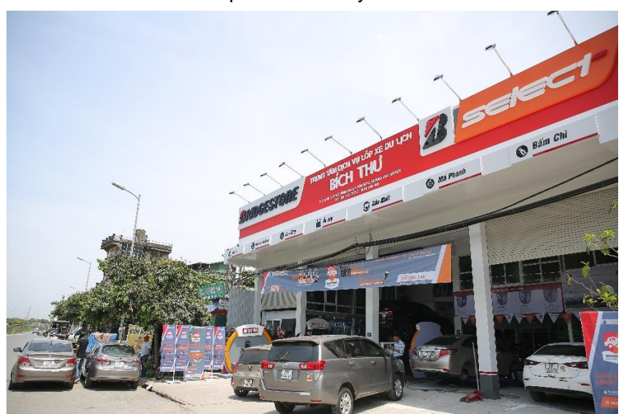
Bich Thu is officially upgraded to B-select, providing authentic Bridgestone tyres with international-standard services.

In recent years, in parallel with the significant rise of the automobile market, the demand for car and tyre services is growing. More than ever, customers want to experience the best technologies, want to be served by the top qualified employees with an utmost professional service attitude. This requires traditional dealers to constantly improve the quality of their services to keep up with the current trend. This is an essential and inevitable development of the tyre market.