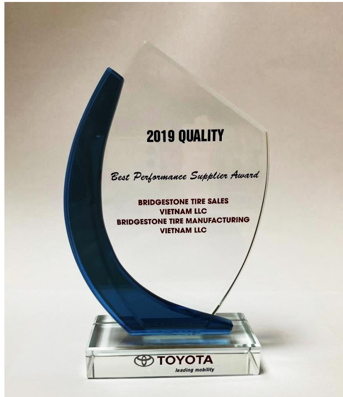
This is the second consecutive year Bridgestone have been entitled as “2019 Quality Best Performance Supplier Award” by Toyota